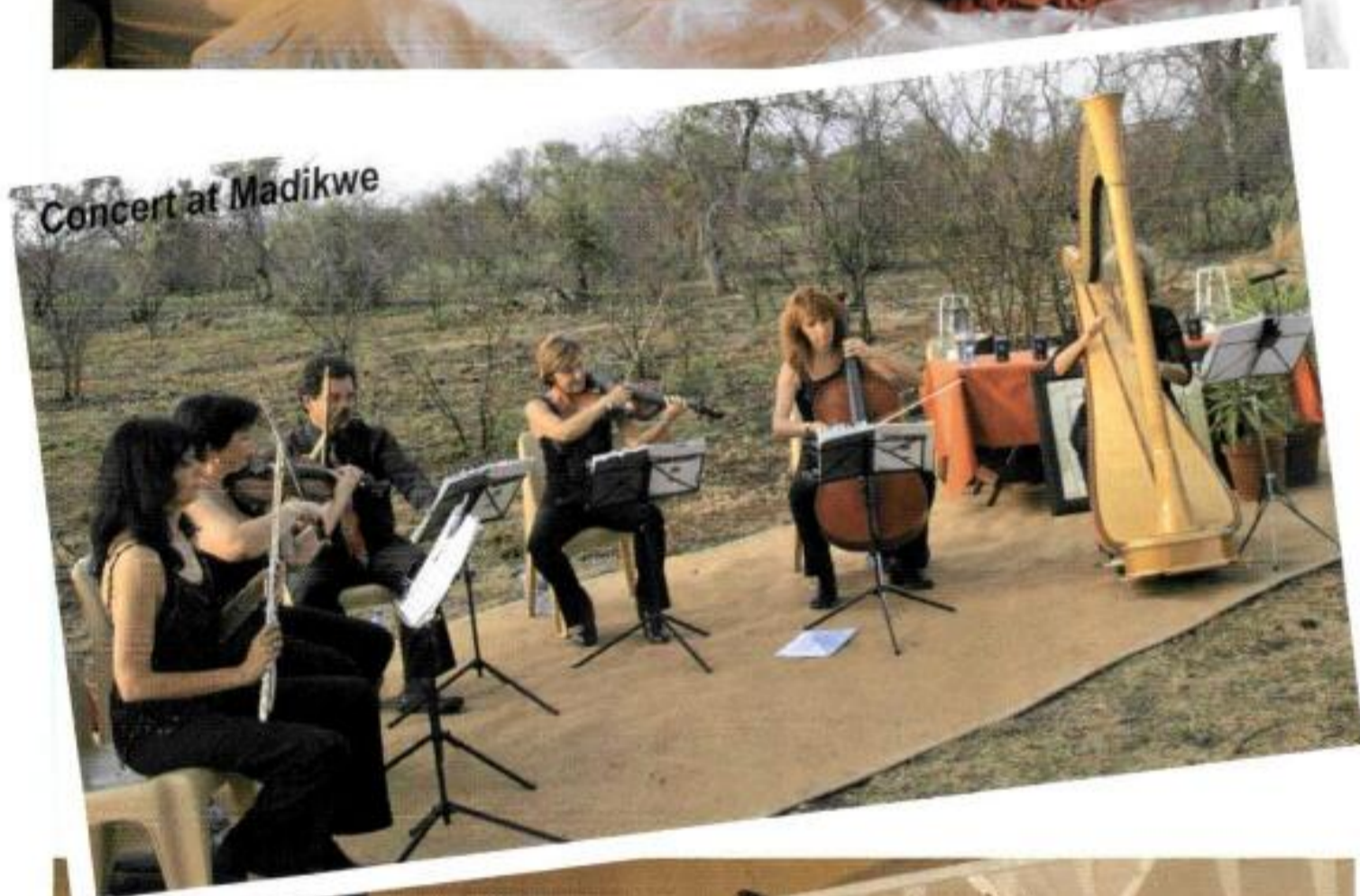
Concert at Madikwe