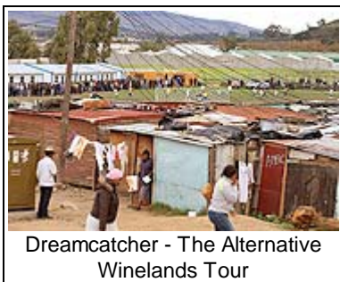
Dreamcatcher - The Alternative Winelands Tour