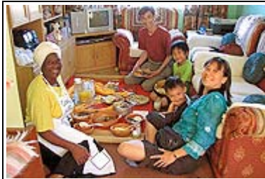
Dreamcatcher - The Alternative Winelands Tour