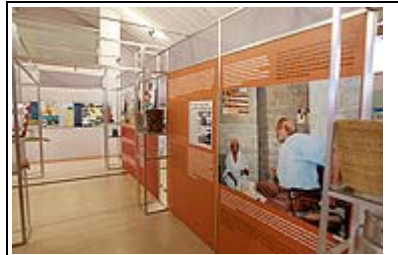
Dreamcatcher - The Alternative Winelands Tour