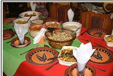
Dreamcatcher - The Alternative Winelands Tour