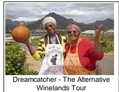
Dreamcatcher - The Alternative Winelands Tour