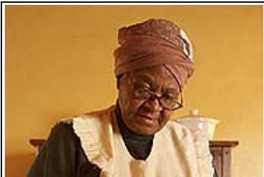
Dreamcatcher - The Alternative Winelands Tour