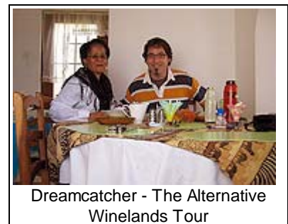
Dreamcatcher - The Alternative Winelands Tour