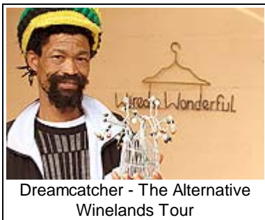
Dreamcatcher - The Alternative Winelands Tour