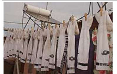
Dreamcatcher - The Alternative Winelands Tour