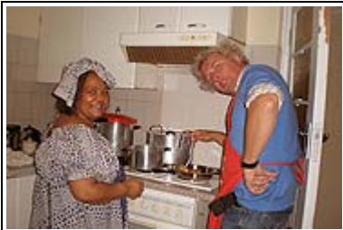
Dreamcatcher - The Alternative Winelands Tour