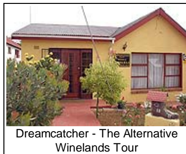
Dreamcatcher - The Alternative Winelands Tour