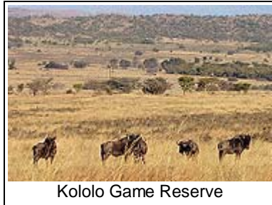
Kololo Game Reserve