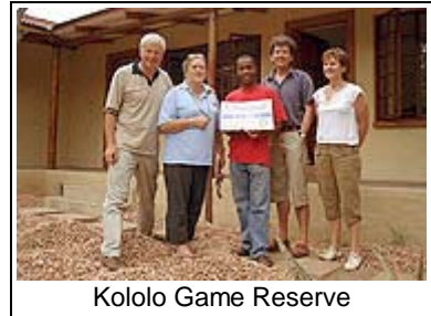
Kololo Game Reserve