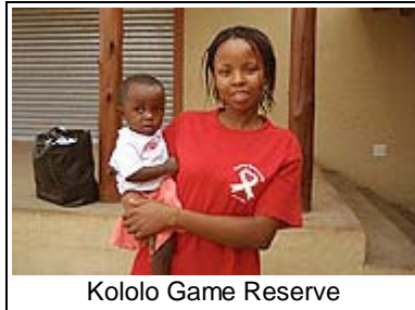
Kololo Game Reserve