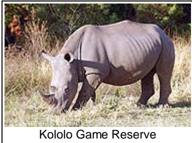
Kololo Game Reserve