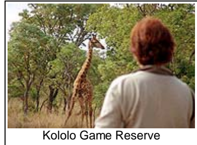
Kololo Game Reserve