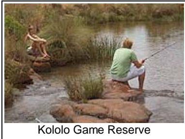
Kololo Game Reserve